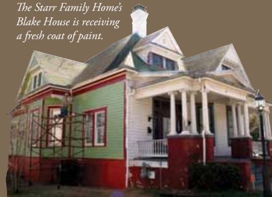
The Starr Family Home's Blake House is receiving a fresh coat of paint.